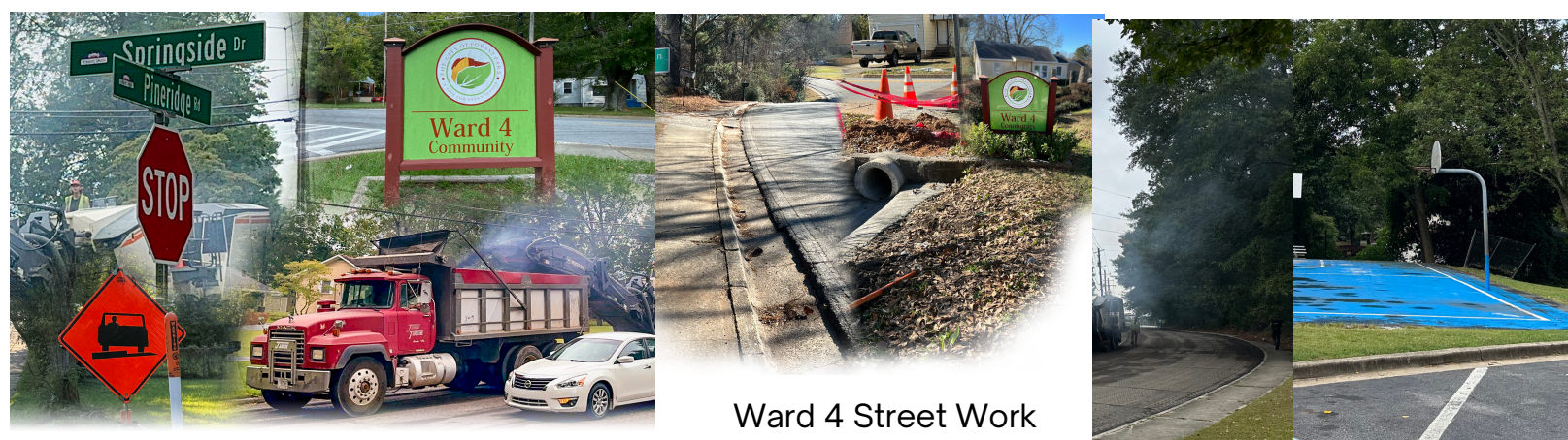
Ward 4 Street Work