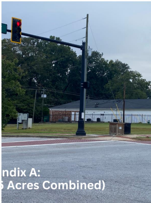
Appendix A: 794 Main St. (.36 Acres Combined)