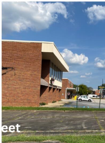
Appendix A: Building: 850 Main Street