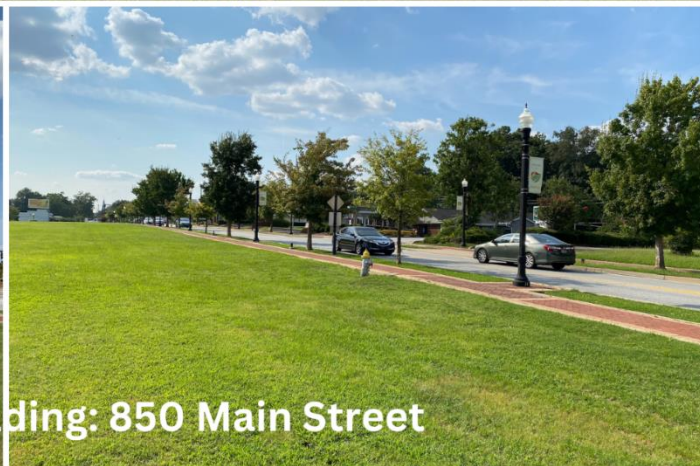
Appendix A: Building: 850 Main Street