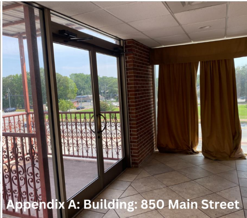
Appendix A: Building: 850 Main Street