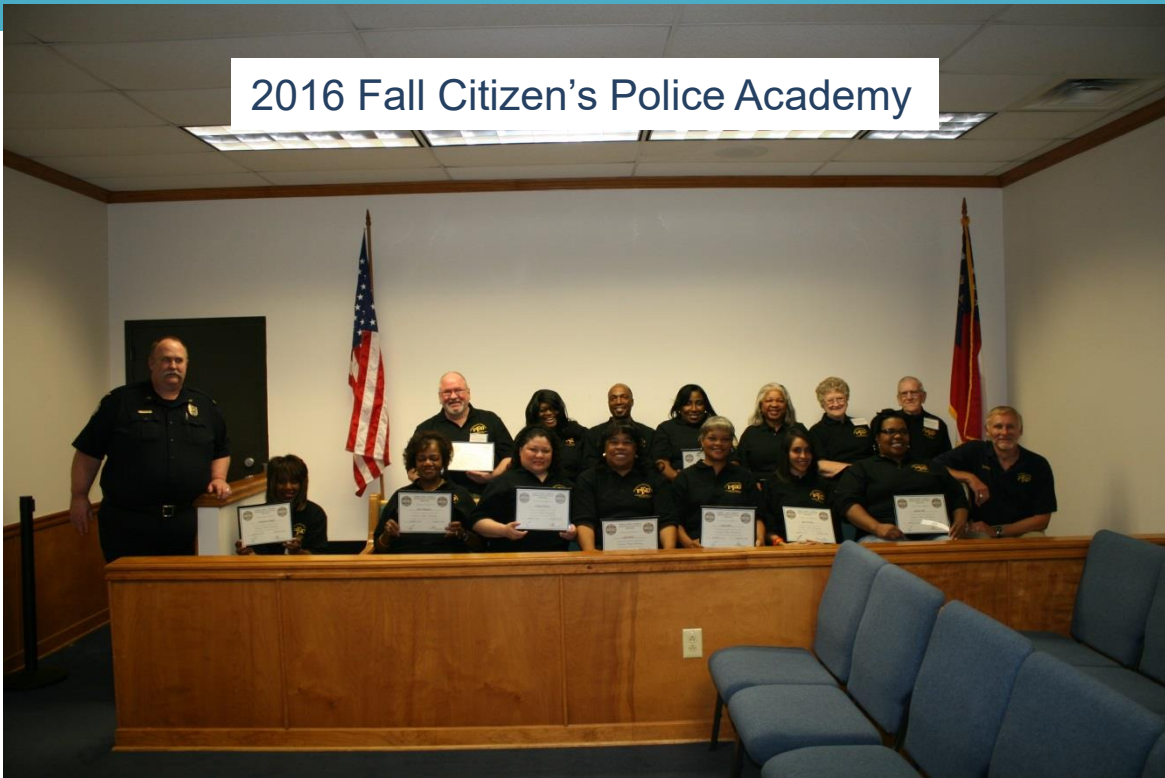
2016 Fall Citizen's Police Academy