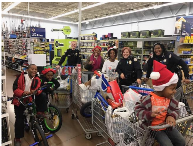
2016 "Shop with a Cop"