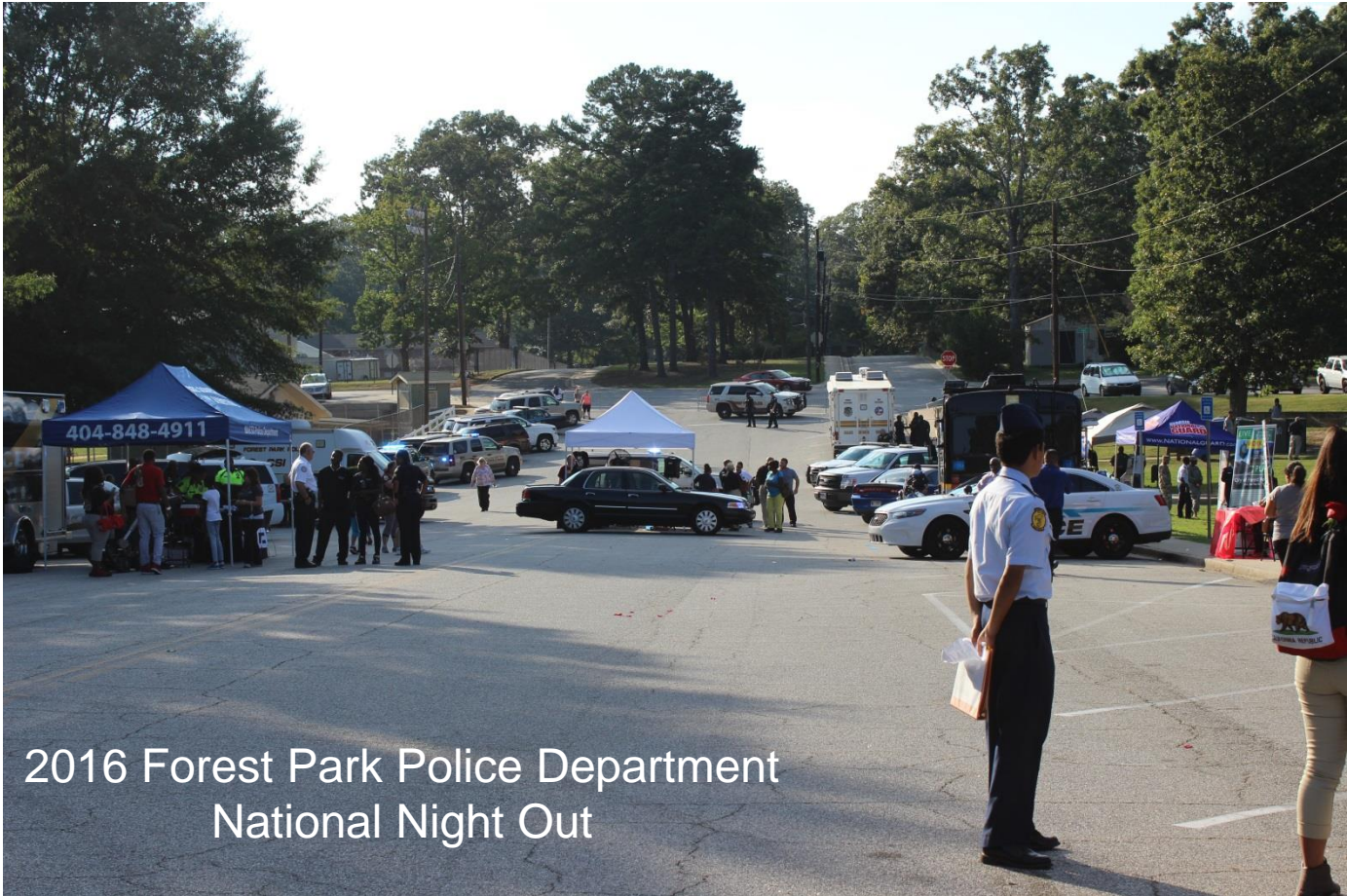
2016 Forest Park Police Department National Night Out

The Forest Park Police Department will deliver effective and responsive law enforcement services to all the citizens in a fair and equitable manner.